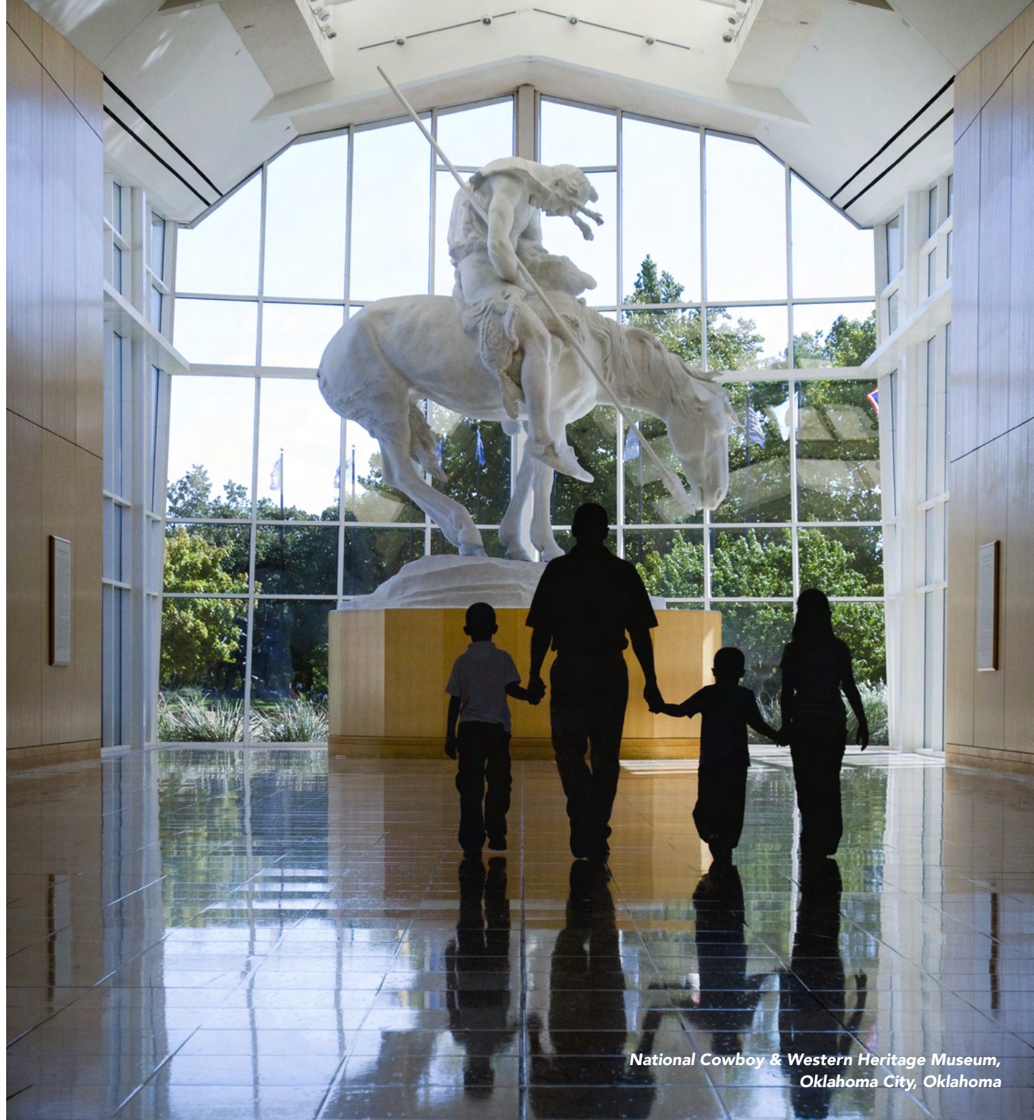
National Cowboy & Western Heritage Museum, Oklahoma City, Oklahoma