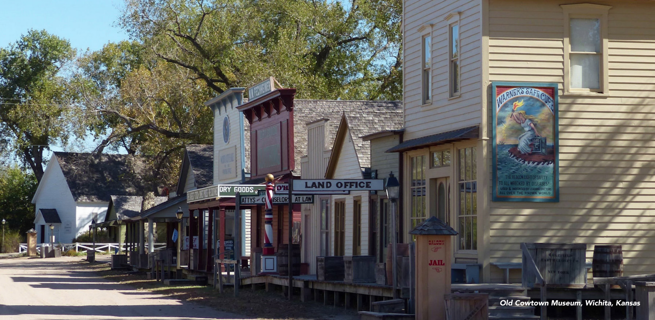
Old Cowtown Museum, Wichita, Kansas