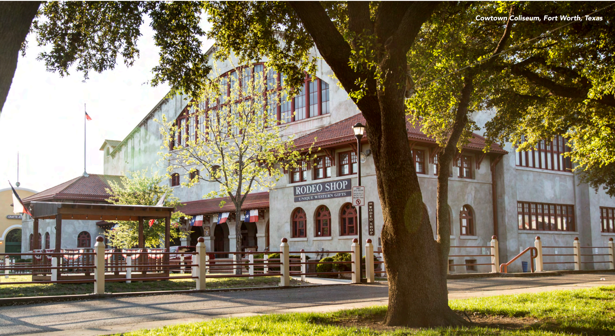
Cowtown Coliseum, Fort Worth, Texas