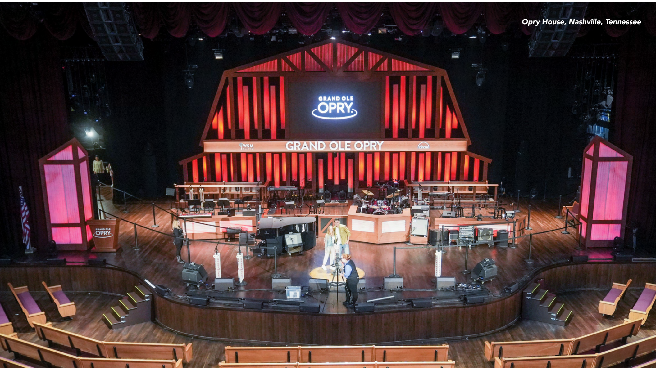
Opry House, Nashville, Tennessee