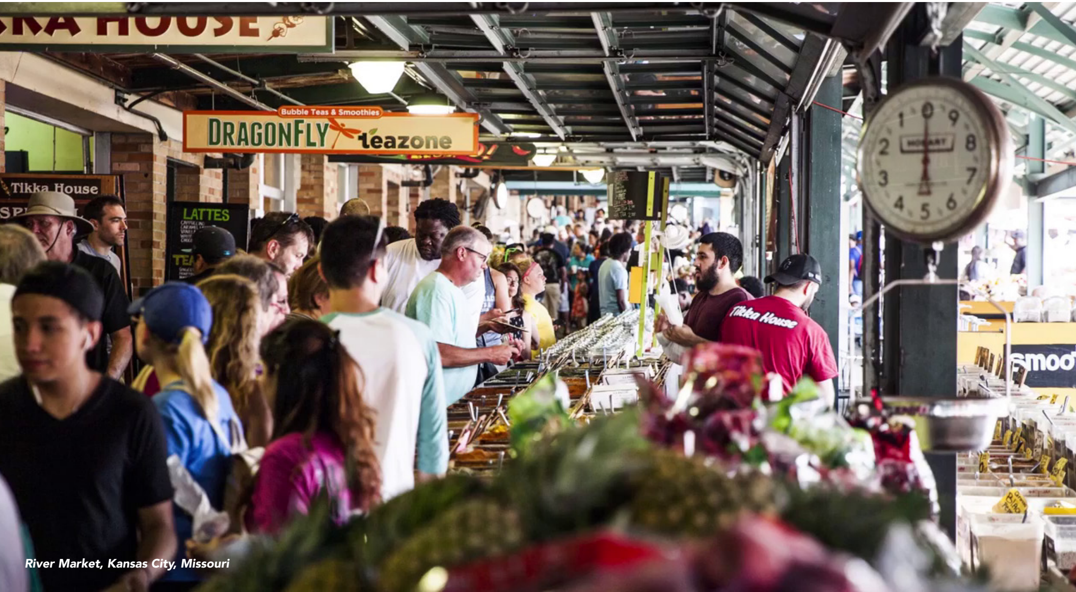
River Market, Kansas City, Missouri