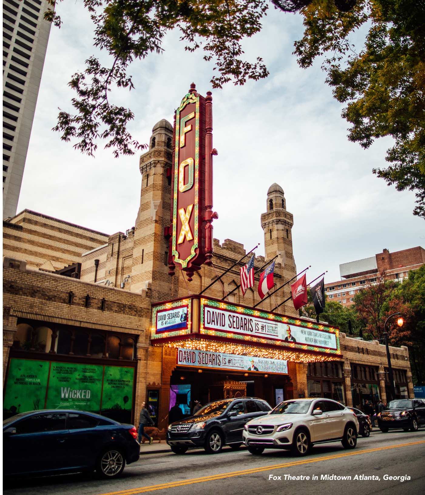
Fox Theatre in Midtown Atlanta, Georgia