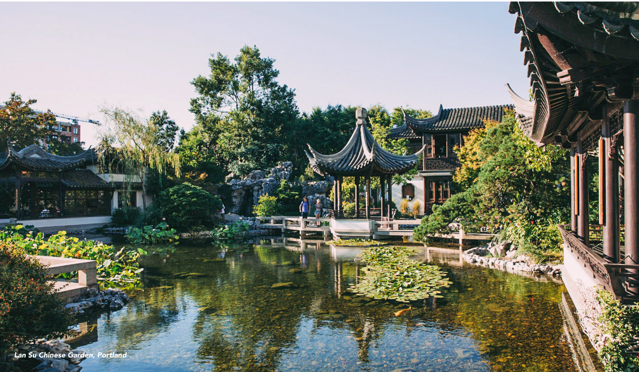
Lan Su Chinese Garden, Portland