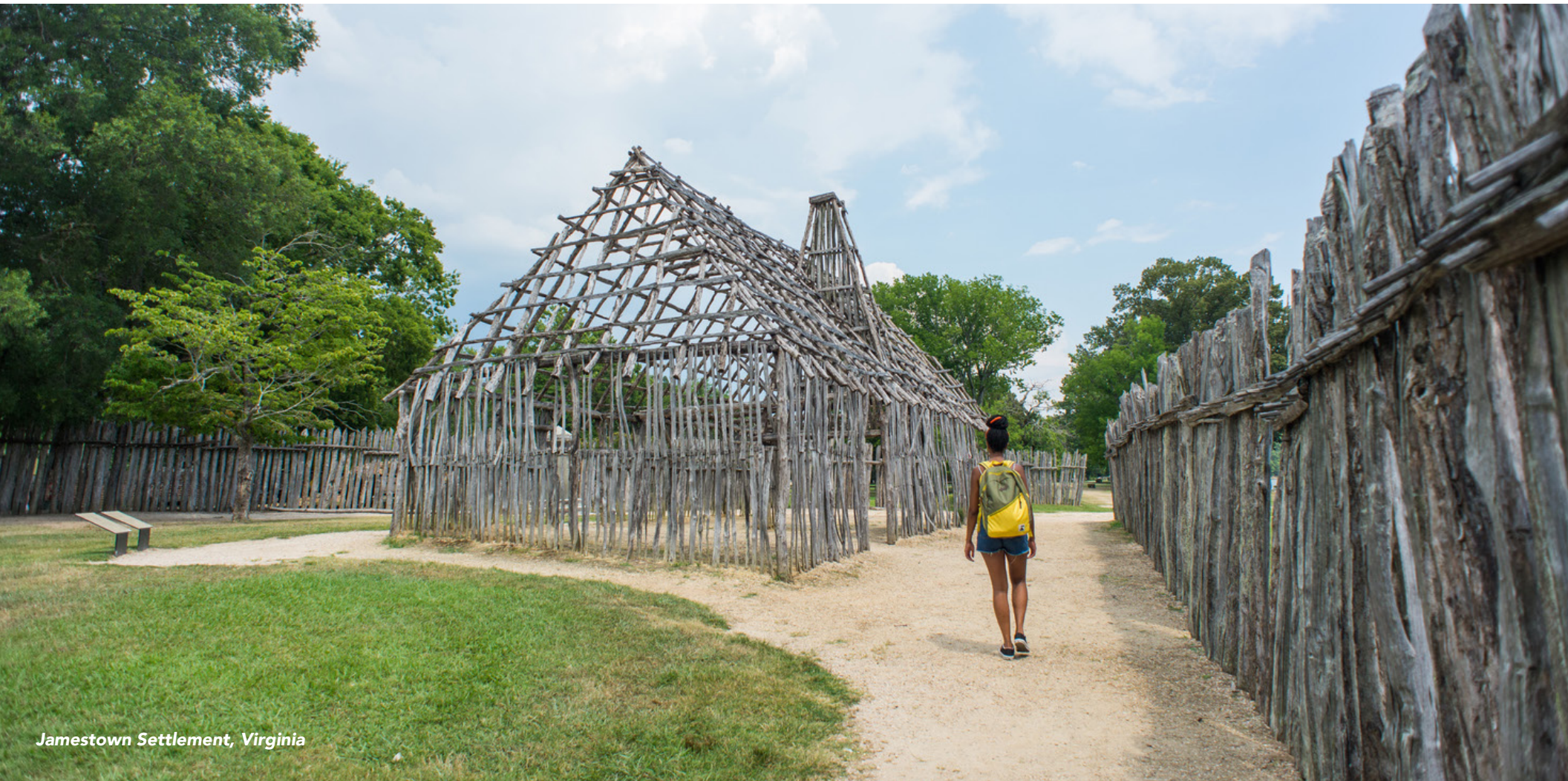
Jamestown Settlement, Virginia