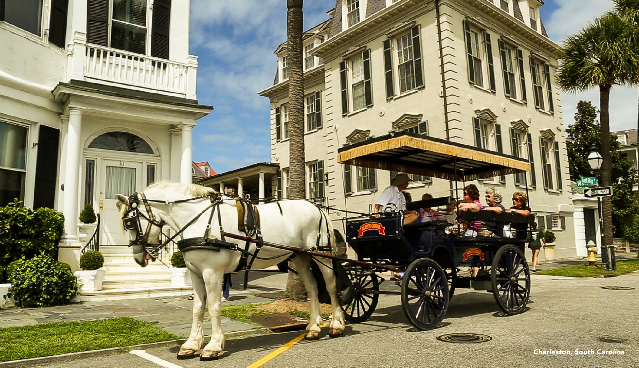
Charleston, South Carolina