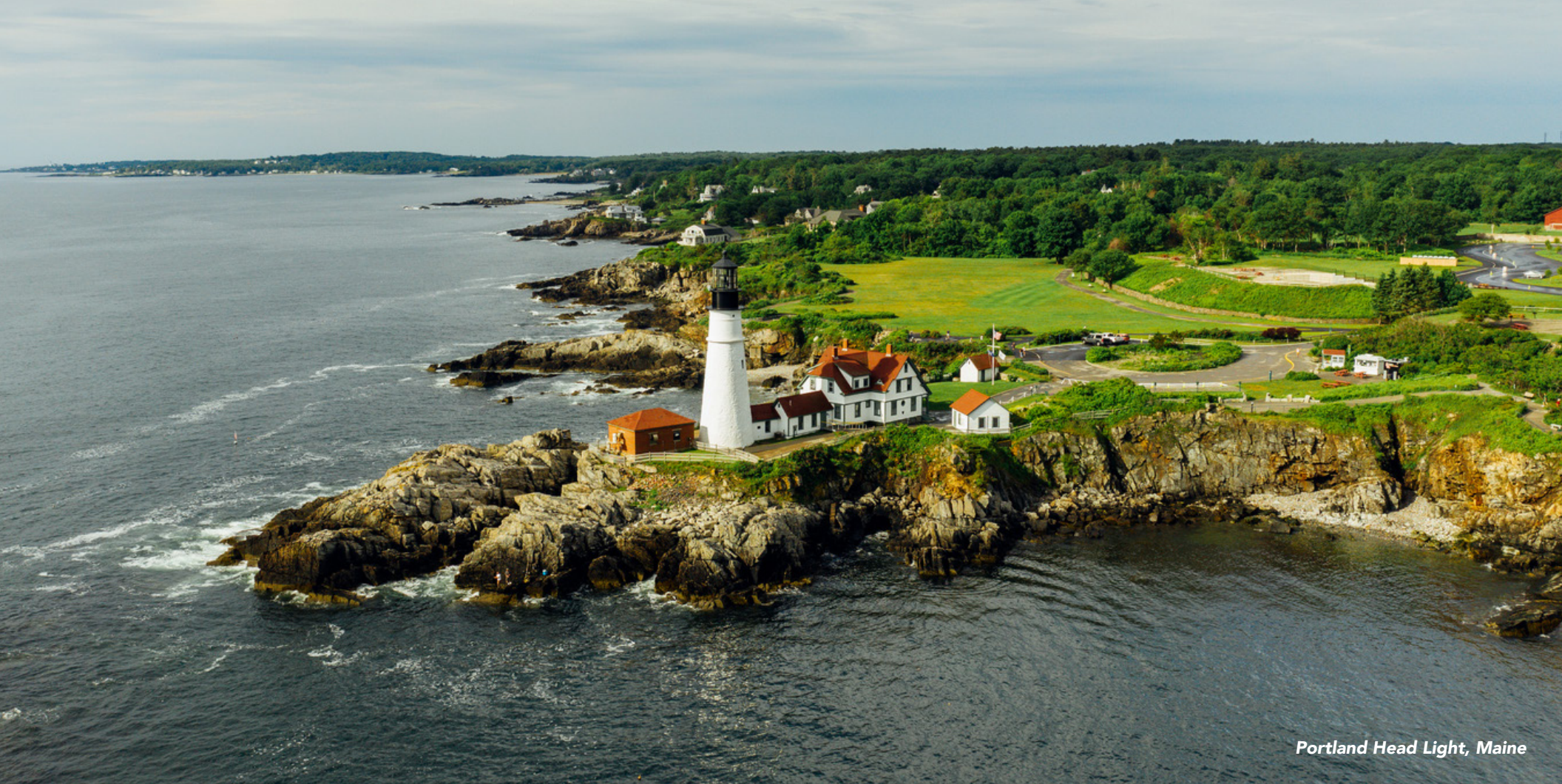
Portland Head Light, Maine