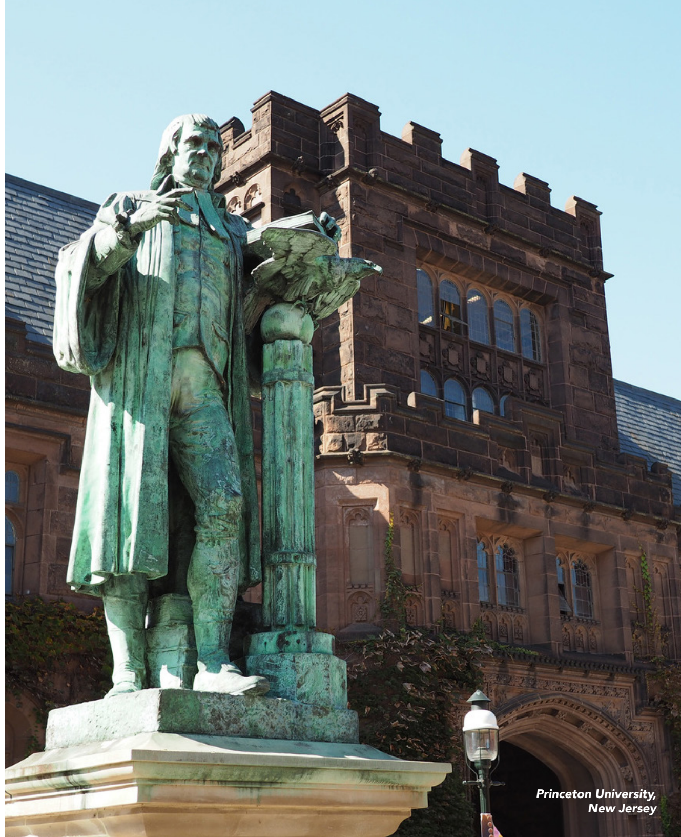
Princeton University, New Jersey

Accommodation: Philadelphia, Pennsylvania