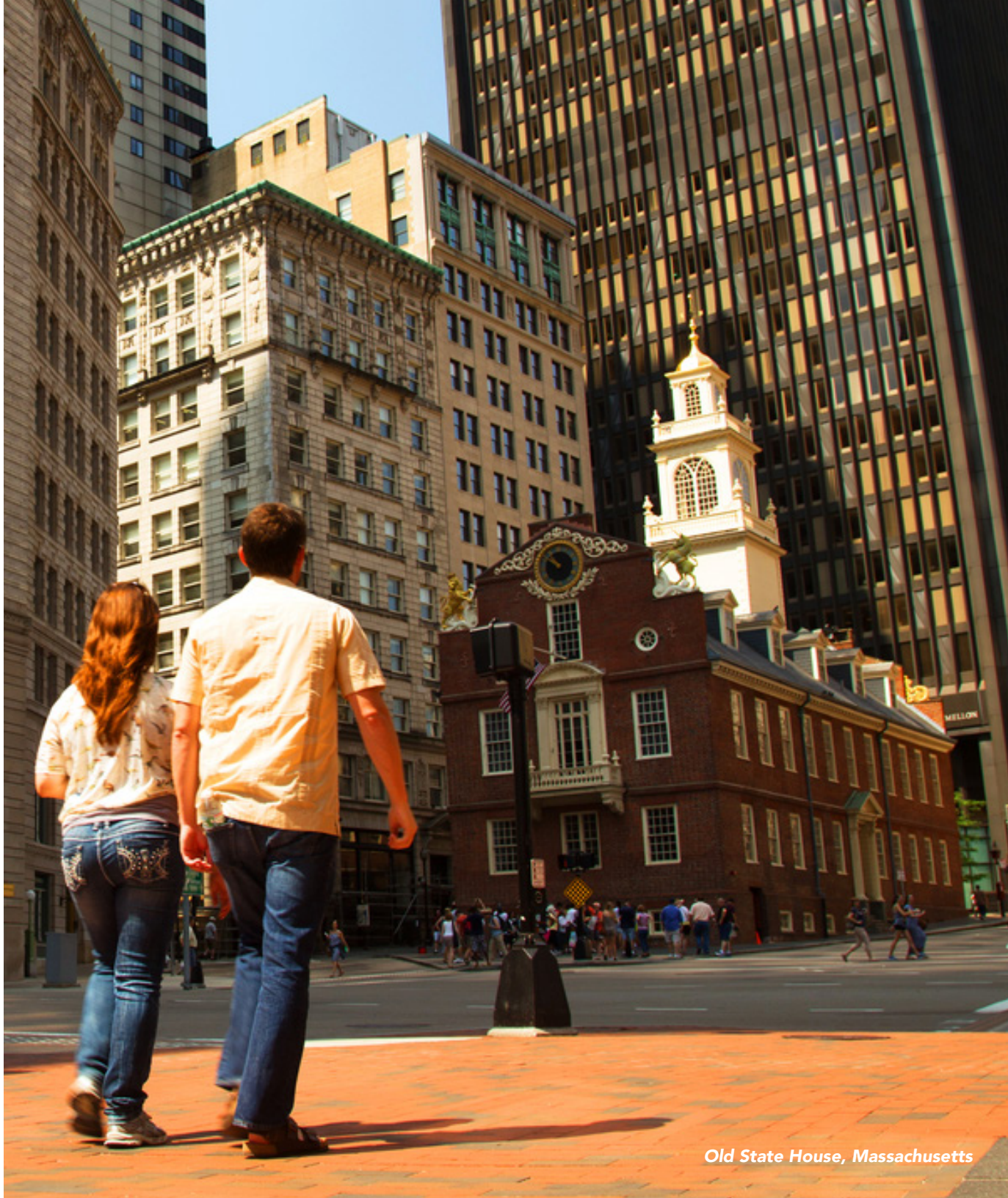
Old State House, Massachusetts