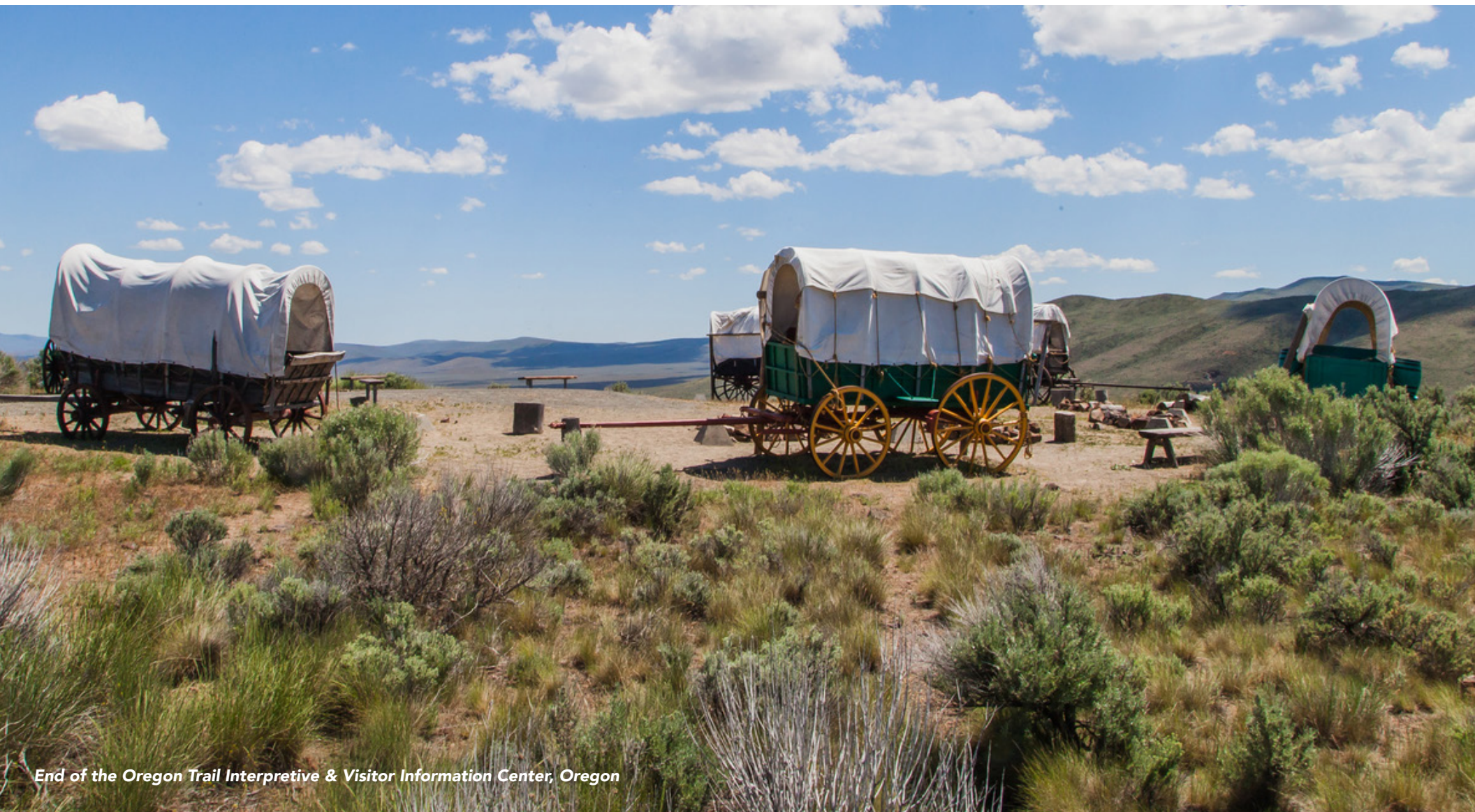
End of the Oregon Trail Interpretive & Visitor Information Center, Oregon

For more trip inspiration and travel ideas throughout the USA, go to: VisitTheUSA.com