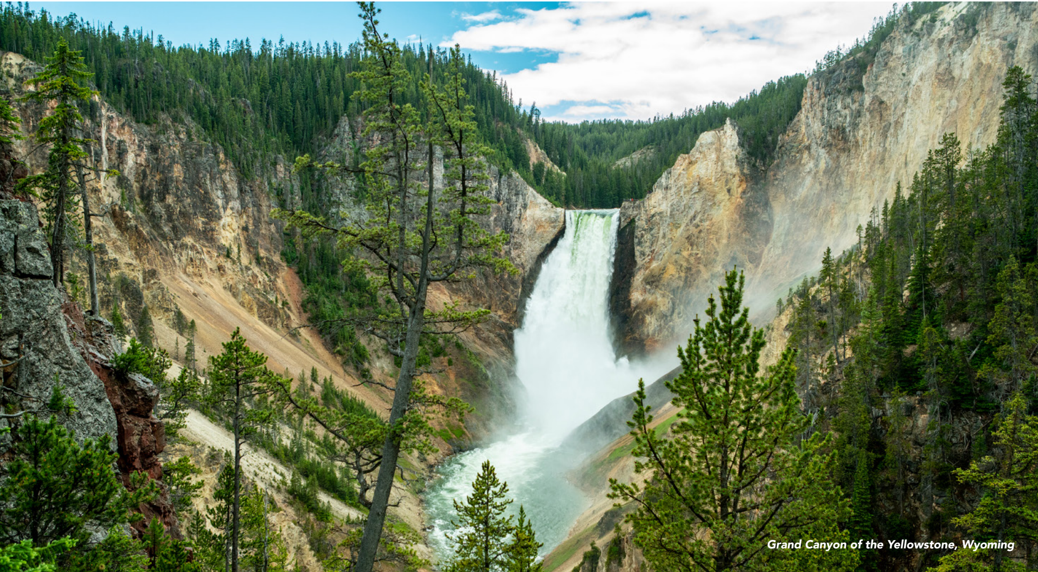
Grand Canyon of the Yellowstone, Wyoming