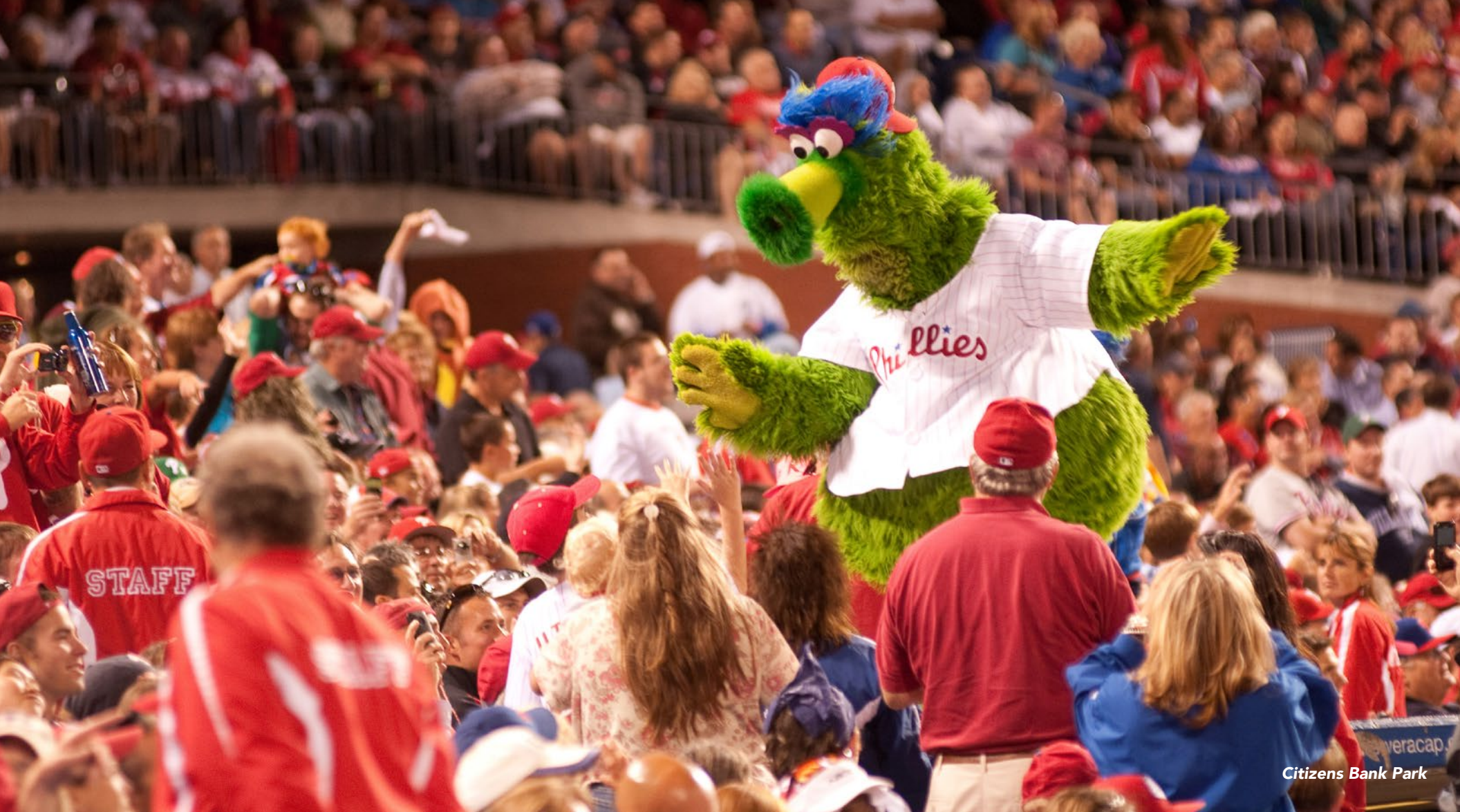
Citizens Bank Park